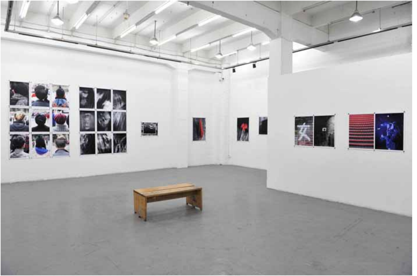
View Exhibition Room