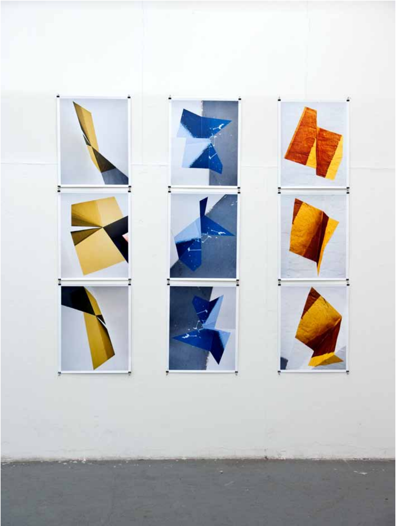
The third part of the show