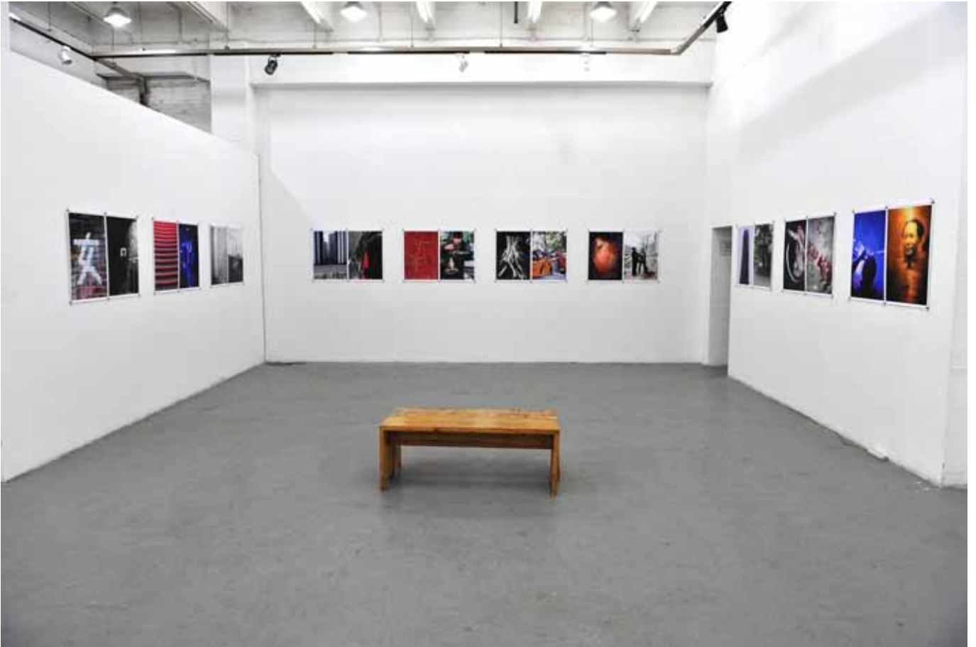
The fourth part of the show