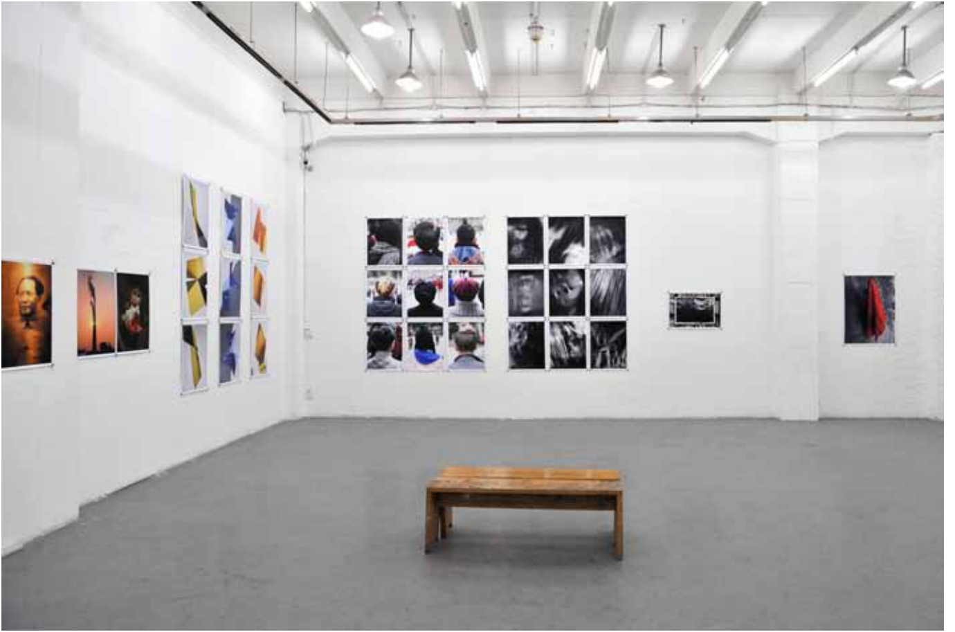
View Exhibition Room