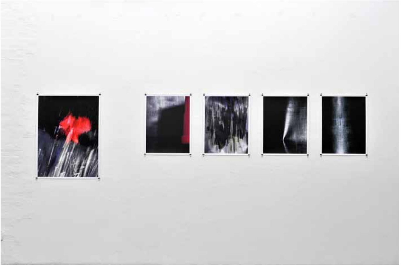
The first part of the show